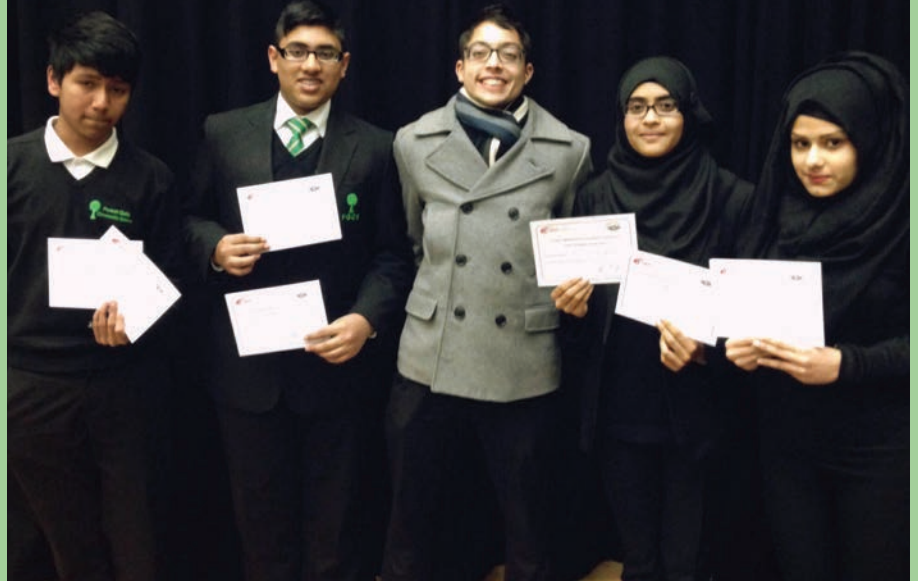
Source of pride: Pupils celebrate their performance in a national maths competition