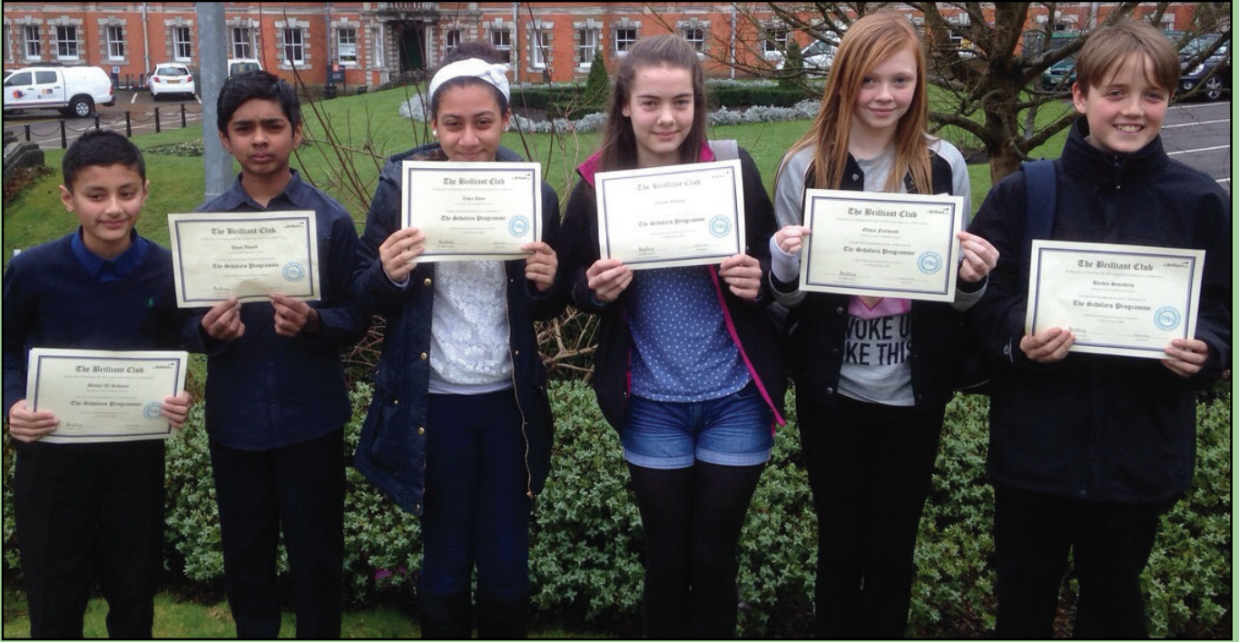
Pass masters: Youngsters proudly show off their certificates after attending a six-week university-style teaching programme